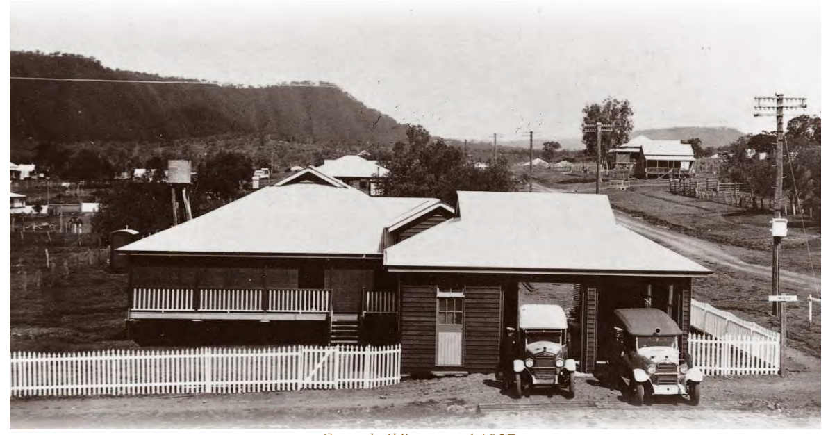
Centre building opened 1927

During April 1935, the Superintendent and a vehicle were sent to the official opening of the Injune/Springsure Road.