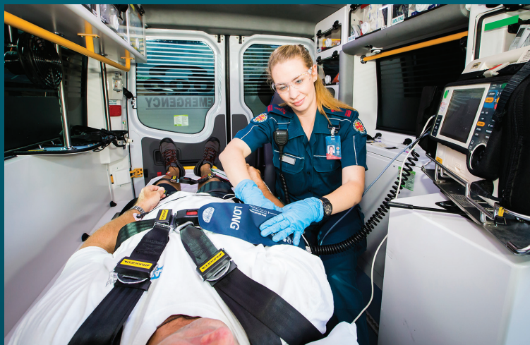
An Advanced Care Paramedic treating a patient