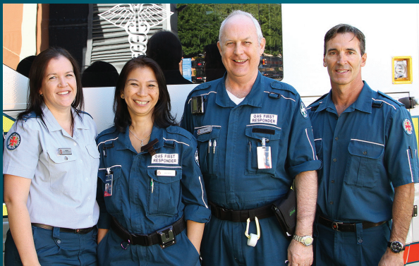
QAS operational staff with First Responders

For further information on our volunteer opportunities, visit www.ambulance.qld.gov.au/volunteers.html or contact 13 QGOV (13 74 68) .