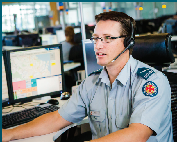
An Emergency Medical Dispatcher answering a Triple Zero (000) call

Our systems, equipment and standards are first-class, but our greatest assets are our people – from volunteers giving up their time for the benefit of their community and QAS, to our highly trained clinicians who make a real difference to the lives of their patients.