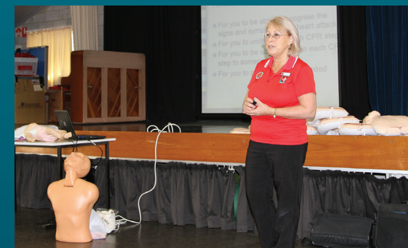
An LAC member delivering a CPR Awareness session

LACs also deliver vital community safety training sessions through the CPR Awareness program where community members learn CPR for a gold coin donation in just 90 minutes.