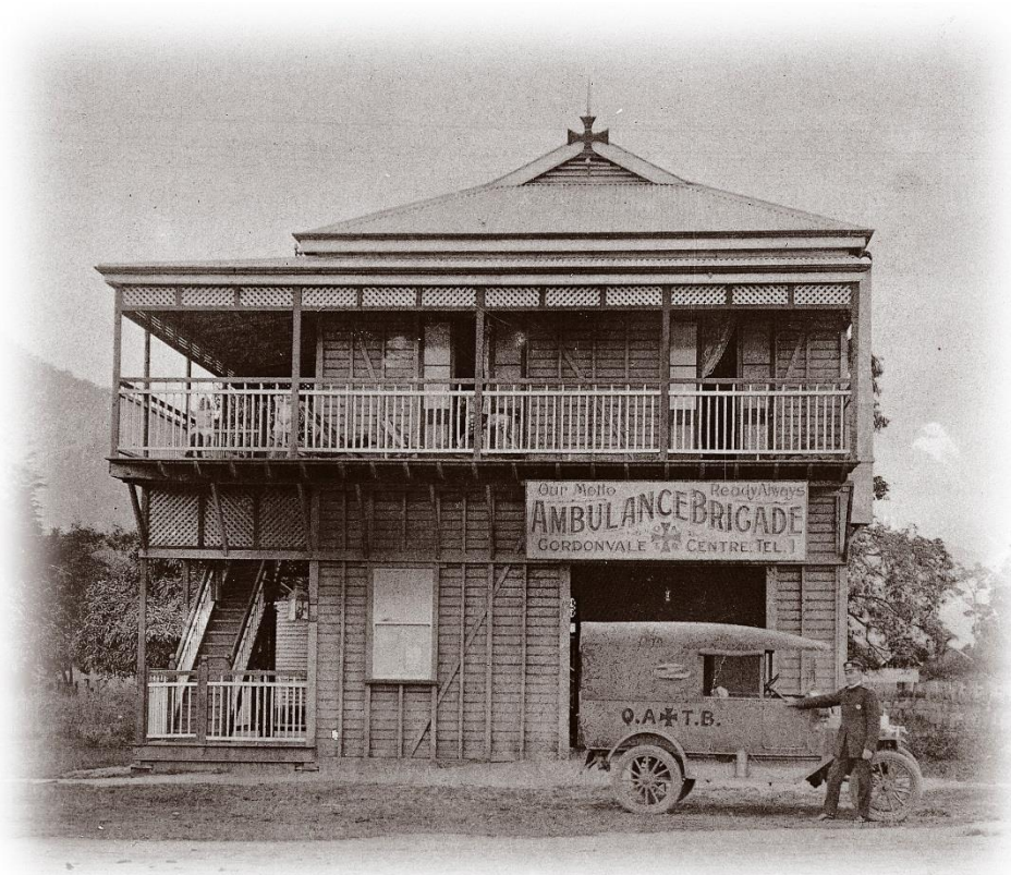
Centre building 1914