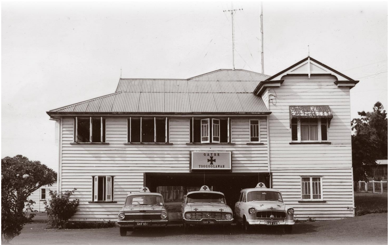
Centre building 1925-1982

In 1925 the Committee decided that as the service was firmly established it should acquire buildings in keeping with the service and have everything centralised. It was considered that the site occupied was not quite suitable.