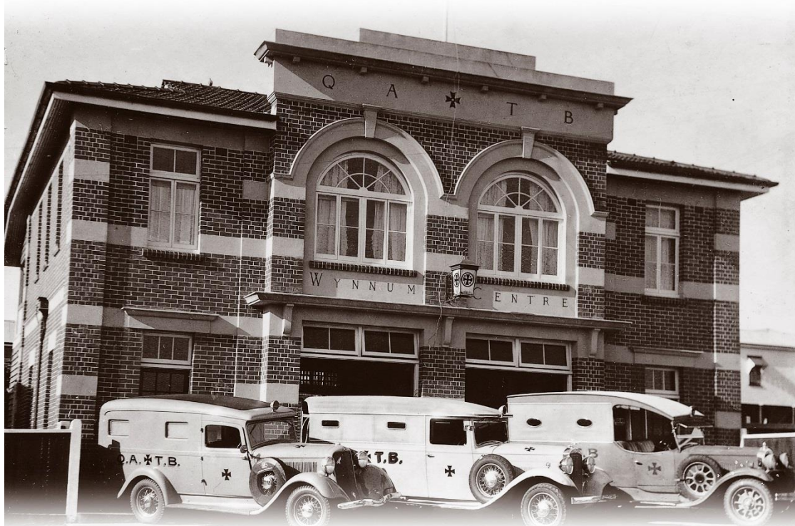
Centre building opened 1927

The foundation of the present building was laid by the Hon A.J. Thynne, President of the QATB State Executive in January 1926. The cost of the building was approximately £3,500 and was officially opened by the Minister of Works (Hon J. Kirwan) on 19 November 1927. Since that time several additions and alternations have been made.